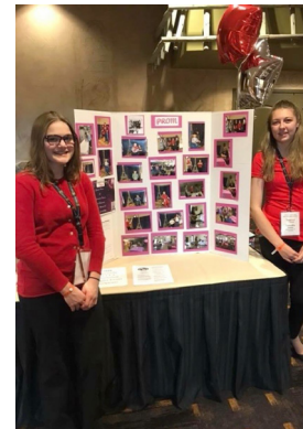
Wisconsin Rapids Area Middle School FCCLA

To obtain a chapter grant, chapters must, submit a Chapter Grant Application to the WI FCCLA Foundation. The application is located on the following web sites: http://www.wifcclafoundation.org or http://www.wifccla.org This year's deadline is November 13, 2018.