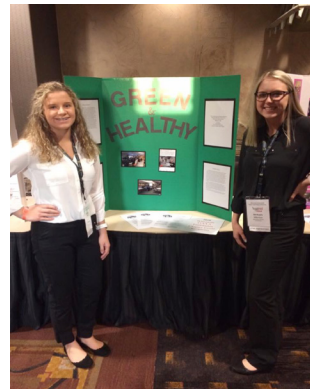
Black River Falls High School FCCLA